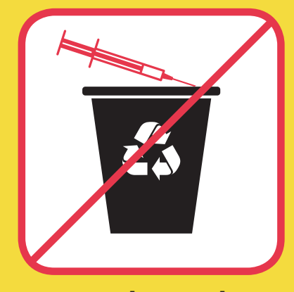
put sharps in recycling bin.