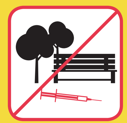
throw sharps in bushes, parks, or streets.