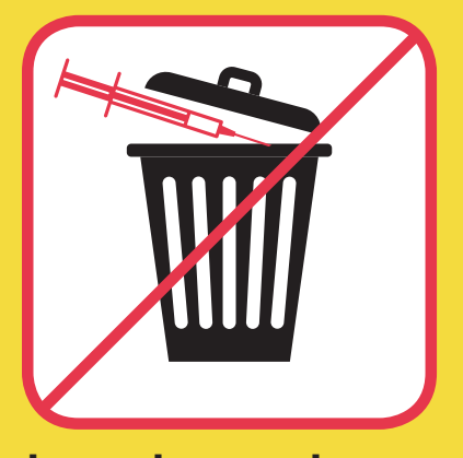
throw loose sharps in garbage.