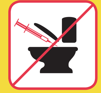
flush sharps down toilet.